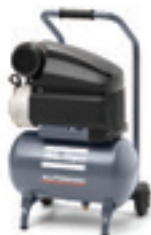
AF 20 E 10