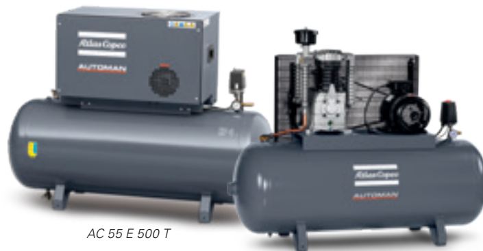
AC 55 E 500 T