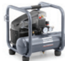
AF 25 E 6

AF Series , 230 V1 phase 10 bars/145 psig for AF 25 , 400 V 3 phases 10 bars/145 psig and 230 V1 phase 10 bars/145 psig for AF30 Direct drive stationary or mobile -9, 10, 2 x 11, 20, 24, 50 or 90 liters horizontal receiver