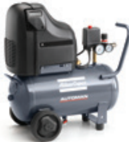
AH 15 E 24