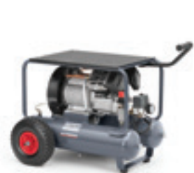
AF 30 E 2X11