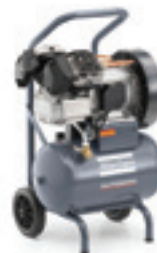
AF 30 E 24