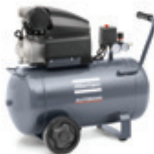
AF 25 E 50