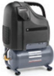
AH 10/15 E 6

AH series oil-free compressors are designed for a variety of applications. With no oil to replace and with the electric motor flanged to the compressor block, maintenance is reduced to the absolute minimum. Their all-aluminium, low-weight construction makes them the ideal choice when a smaller amount of compressed air is sufficient. They can be laid flat for transport.