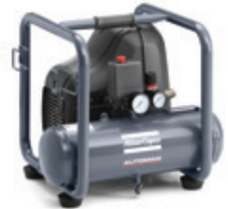
AH 20 E 6